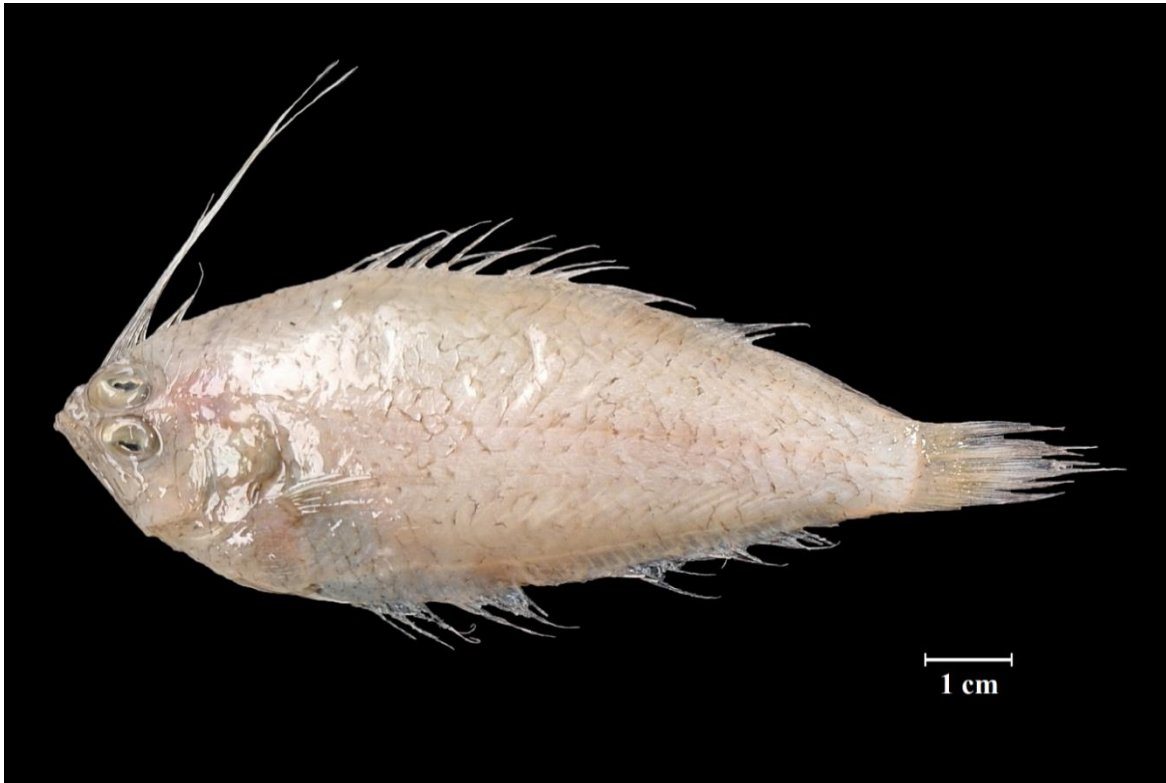
Fig.1. Specimen of Laiopteryx novaezeelandiae collected from the northern coast of the Persian Gulf, Hormuz Island (115mm SL).

characters were measured with a clipper (0.02mm accuracy) and meristic characters were counted under a stereomicroscope (Khajavi & Alavi-Yeganeh 2022) to compare those characters with previously reported data (Carpenter & Niem, 2001). DNA was extracted using the phenol/chloroform protocol and COI gene fragment was amplified using universal primers Fish F1 and Fish R1 (Alavi-Yeganeh & Deyrestani 2016). The identified haplotype of COI, with a length of 632 bp, was submitted in GenBank (PV719947). Genetic distance among the identified haplotype of L. novaezeelandiae from the Persian Gulf, other recorded haplotypes of this species from the coastal waters of China (MK617133), India (PQ803335), Malaysia (OR918674, OR918766, OR918781) and Saudi Arabia (KU499720), as well as haplotypes of four other Citharid species, were calculated using MEGA11 (Tamura et al. 2021). The cladogram for phylogenetic relationships of the identified haplotypes and other haplotypes of this family was constructed using the Maximum Likelihood (ML) method in raxmlGUI Ver. 2.0 (Elder et al. 2020).