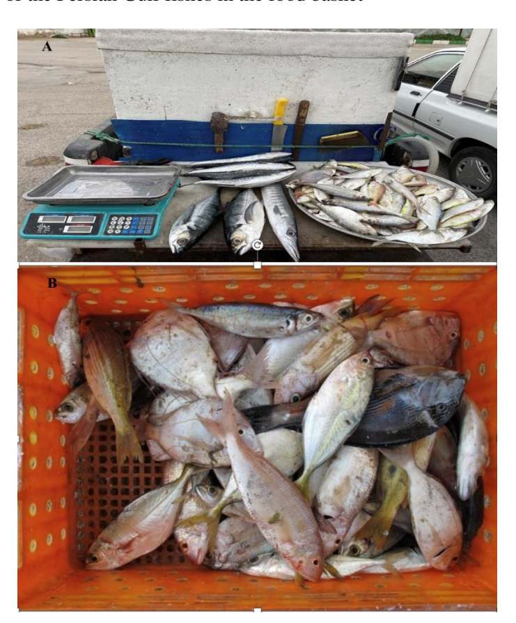
Fig.5. Traditional mobile sales of Persian Gulf fish species in the southern regions of (A) Fars and (B) Bushehr provinces.

Compared to freshwater fish, marine species are an important component to of the southern Fars Province