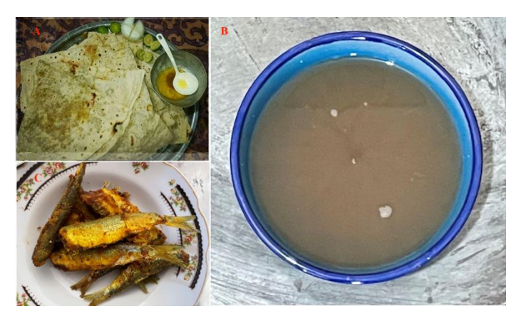
Fig.4. Three forms of Dussumieria acuta ("Hashineh") consumption in the Persian Gulf Region. (A) Bread dipped in salty Hashineh extract. (B) Filtered Hashenahextract. (C) Hashenah fried in oil.

fish consumption market is also influenced by cultural and social tastes as well as advertisements.