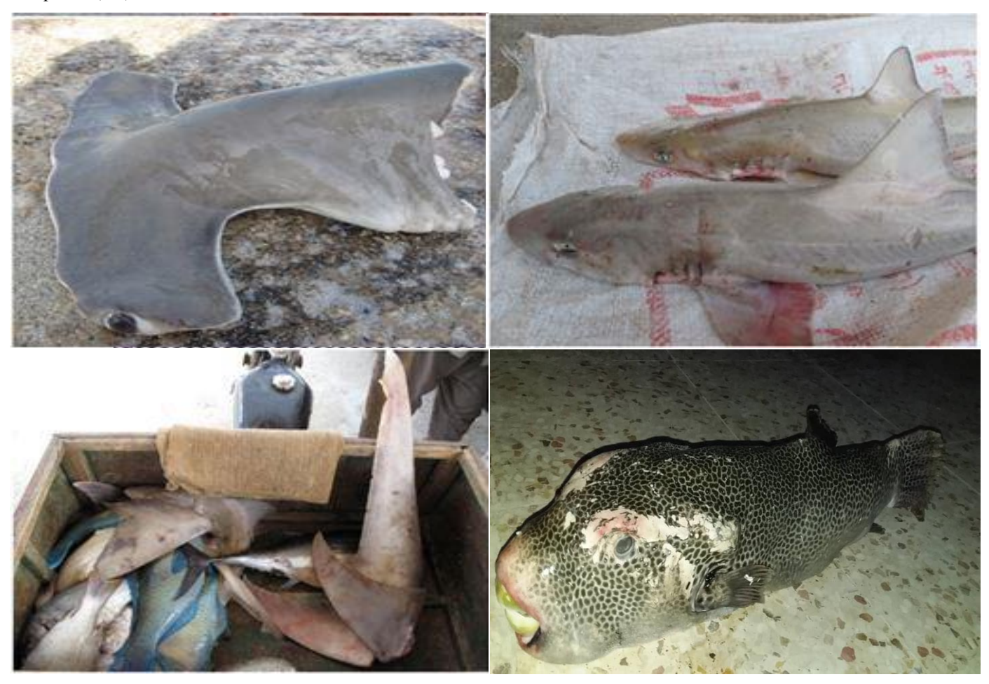
Fig.2. Typical examples of the use of shark meats (A, Sphyrna sp.; B, Carcharhinus dussumieri ) and non-target fish Arothron stellatus (D) in the local food basket, which is becoming more popular and has implications for the conservation threats to sharks.

1800)), "Vir" ( Thunnus tonggol (Bleeker, 1851)), and "Qobad" ( Scomberomorus guttatus (Bloch and Schneider, 1801)) were observed as being among the more expensive species compared to other species.