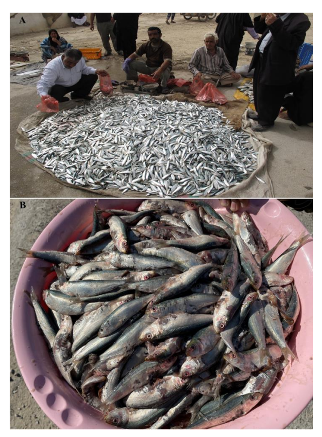
Fig.3. The locally important food fish Dussumieria acuta ("Hashenah") is abundant in winter and sold in at markets in large quantities. (A) Kangan Port, Bushehr Province. (B) Varavi District, Fars Province.