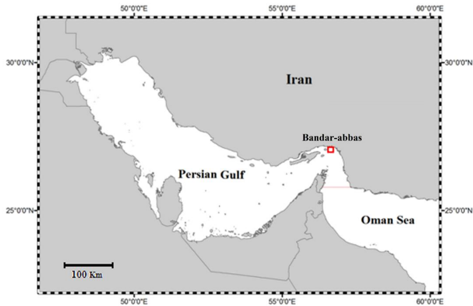
Fig.1. Sampling site of Sillago sihama specimens from coastal water of Bandar-Abbas, Persian Gulf.

al. 2000) (Fig. 2). Otolith weight was measured using a digital balance to the nearest 0.0001g. The left and right otolith dimensions were compared for significant difference (paired student's t-test), and the result indicated a non-significant difference between the left and right otoliths ( P>0.05 ). The relationships between fish standard length vs. otolith lengths, fish standard length vs. otolith width and fish weight vs. otolith weight were evaluated using a linear regression model (L), where Y = a + bX , where Y = Fish standard length (SL, mm) or Fish total Weight (FWE, g) and X = Otolith Length (OL, mm), Otolith Width (OW, mm) and Otolith Weight (OWE, g). 'a' and 'b' were the intercept and slope of estimated relationships (Gamboa 1991; Harvey et al. 2000; Morat et al. 2008; Battaglia et al. 2010; Zan et al. 2015; Khanali et al. 2021). The relationships between otolith length and width vs. fish weight were determined using an exponential regression model (E), Y = aX^b where Y = Fish weight (FW, g) and X = Otolith Length (OL, mm) (Waessle et al. 2003). The regression analysis was done using Excel software (version 2010).