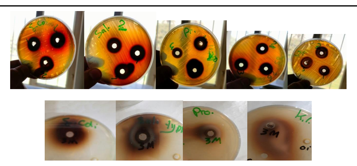
Fig.1. The inhibition zone of different tannin extracts (5%) against bacteria; (1) HT 95%, (2) CT 98%, (3) HT 88%, and (4) CT 88%.