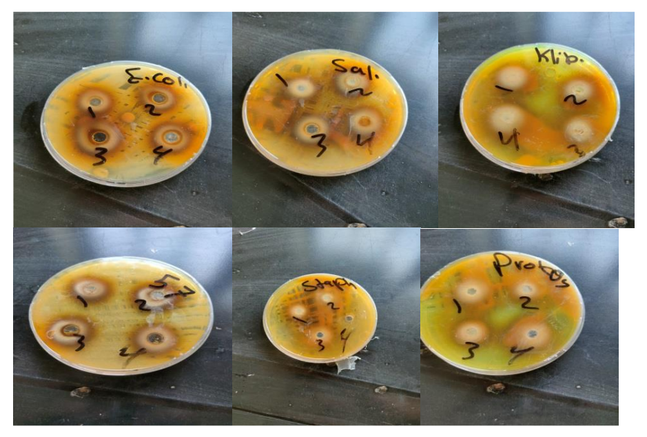
Fig.2. The inhibition zone of different tannin extracts (10%) against bacteria; (1) HT 95%, (2) CT 98%, (3) HT 88%, and (4) CT 88%.