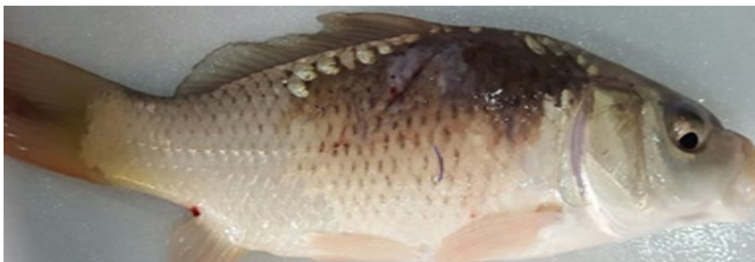
Fig.1. Ulceration necrotic lesions and hemorrhages caused on the skin in Cyprinus carpio .